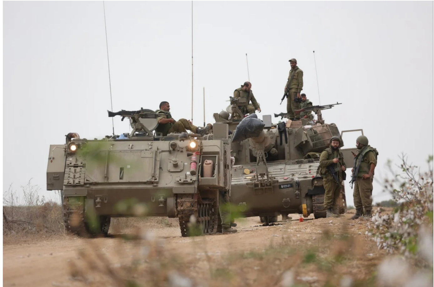
Israeli soldiers pictured near the border with Gaza.